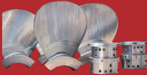
BLADES AND HUB PROPELLER Material: Martensitic Weight: 5 to 15 t