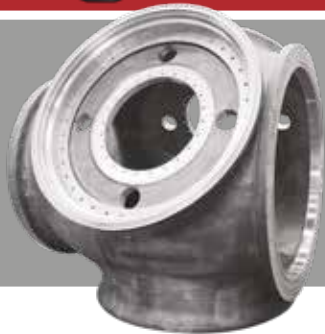
HUB Material: G20Mn5 Weight: 12 t