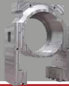
CHOCKS Material: Alloy Steel Weight: 5 t