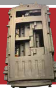
ROOF Material: Cast steel 1.2333, 1.2769S