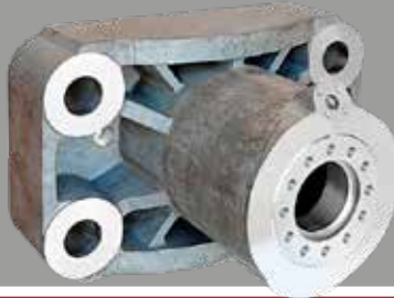
HYDRAULICS Material: GS-52 Weight: 5 t