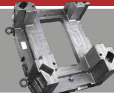
MOULD SUPPORT Material: Alloy Steel Weight: 6 t