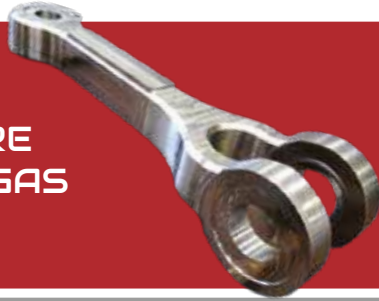
CHAIN LINK Material: Forged Steel Weight: 1 t