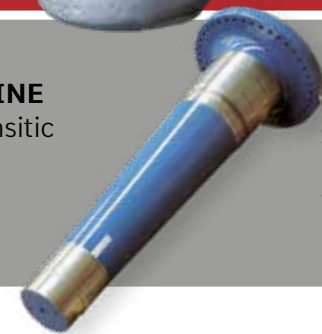
SHAFT Material: Forged Steel Weight: 15 t