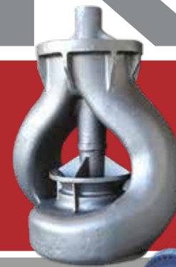
PUMP CASING Material: LCB Weight: 4 t