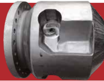
SPOOL Material: Duplex Weight: 3.5 t