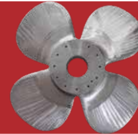
MONOBLOCK PROPELLER Material: Martensitic Weight: 8 t