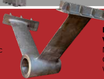
BRACKET V STRUT Material: G20Mn5 Weight: 14 t