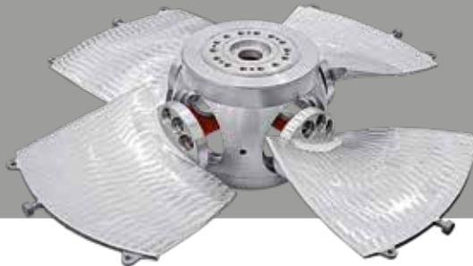
KAPLAN TURBINE Material: Martensitic Weight: Blades: 4 t HUB: 8 t