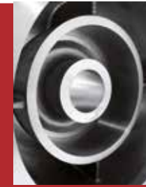
CAST HOUSING Material: Duplex Weight: 1.1 t