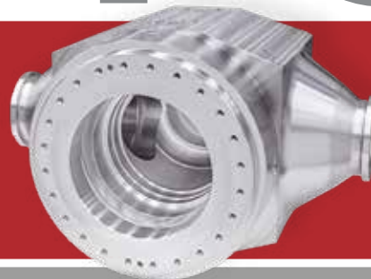
VALVE Material: Duplex Weight: 15 t