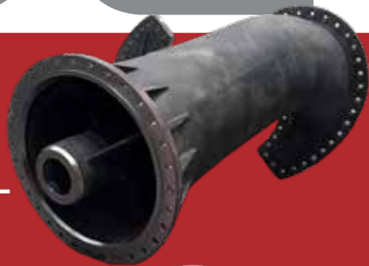
CASING Material: WCB Weight: 8 t