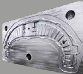
FORM PAD Material: Forged Steel Weight: 20 t