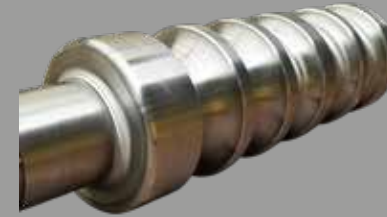
ROLLER Material: Forging Weight: 20 t