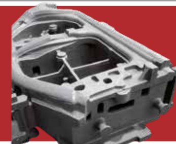
PUNCH / UPPER PAD Material: Cast Steel 1.2333, 1.2320, 1.0446, 1.2769S